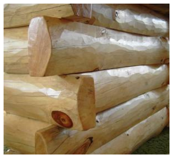
Matching 3" x 8" log siding