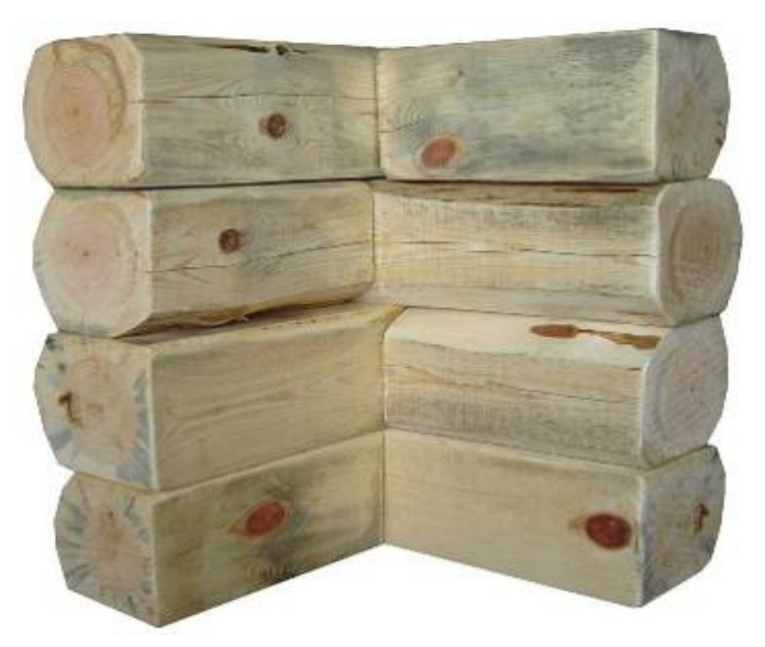
Inside view with wane on the corners