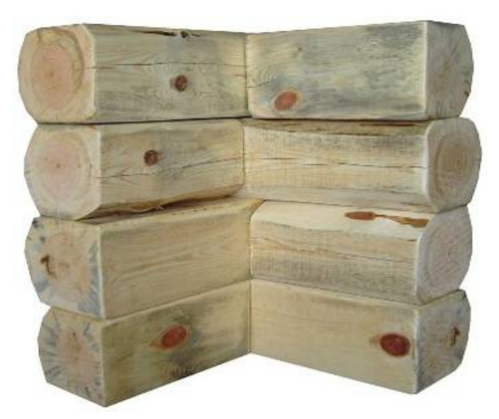
Inside view with wane on the corners