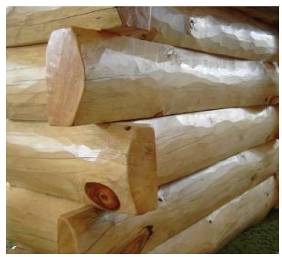
Matching 3" x 8" log siding