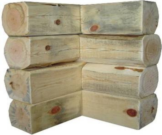
Inside view with wane on the corners