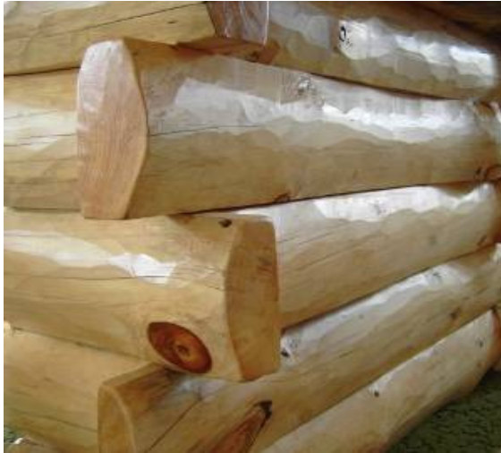
Matching 3" x 8" log siding

Square footage is based on the loft size being 2/3 the main floor.