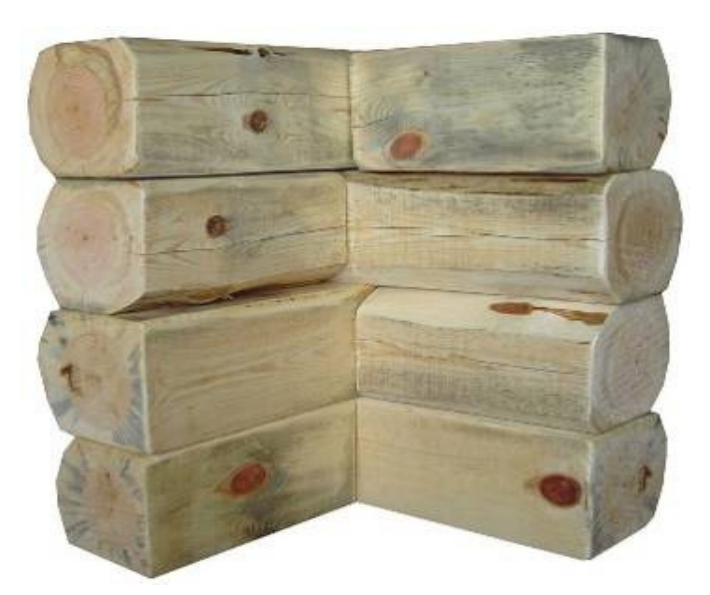
Inside view with wane on the corners