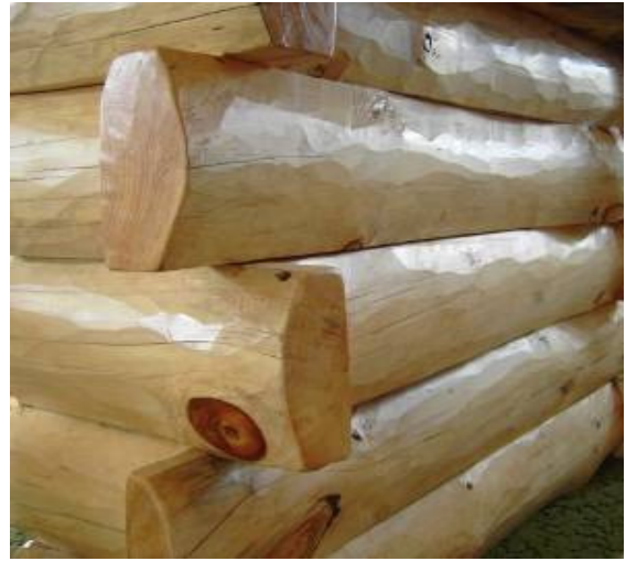
Matching 3" x 8" log siding