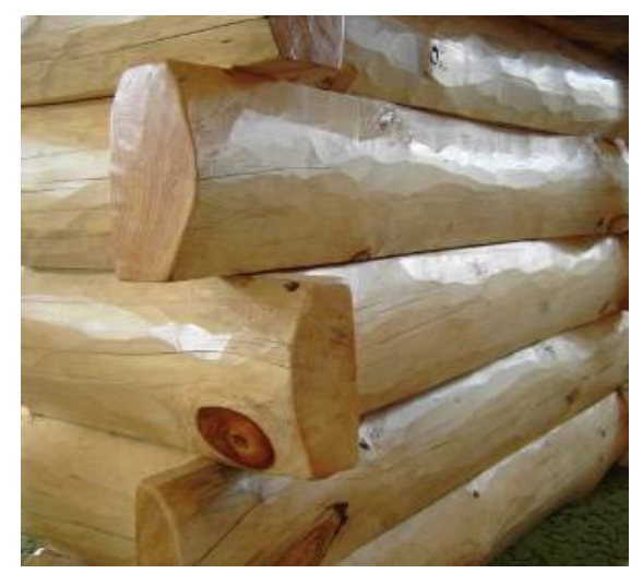
Matching 3" x 8" log siding