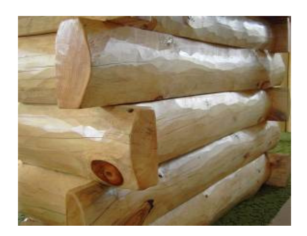
Hand-Peeled 3x8 log siding