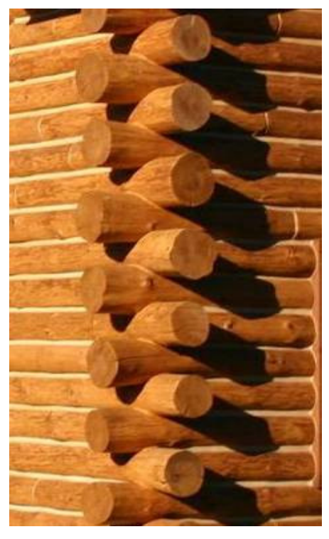
Natural Corner Option (Tails are left full round)