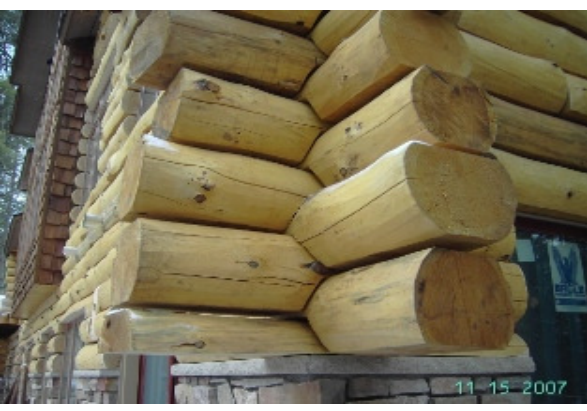
Hand-Peeled 10" Double Round flat on flat with saddle notch option