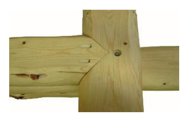
Top view of butt and pass notch