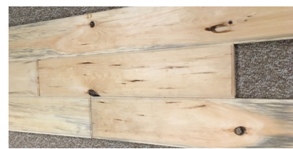
Without middle V-groove and end matched