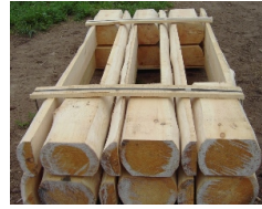
8" Double Round Extensions