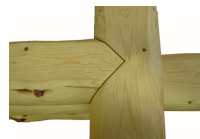
← Top view of the V-cuts