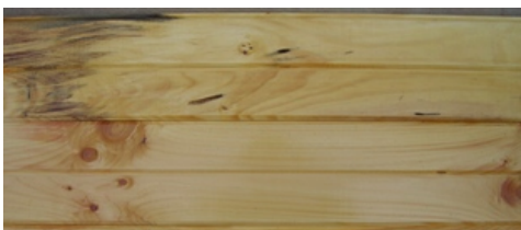
With middle V-groove