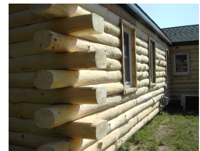
3" x 8" Siding Shown